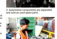
6. Materials like aluminium and steel are crushed up and sold as scrap metal.