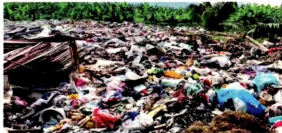
Keadaan tanah lapang yang dikesan menjadi lokasi pembuangan sampah haram di Kampung Cherakah Jaya Meru.