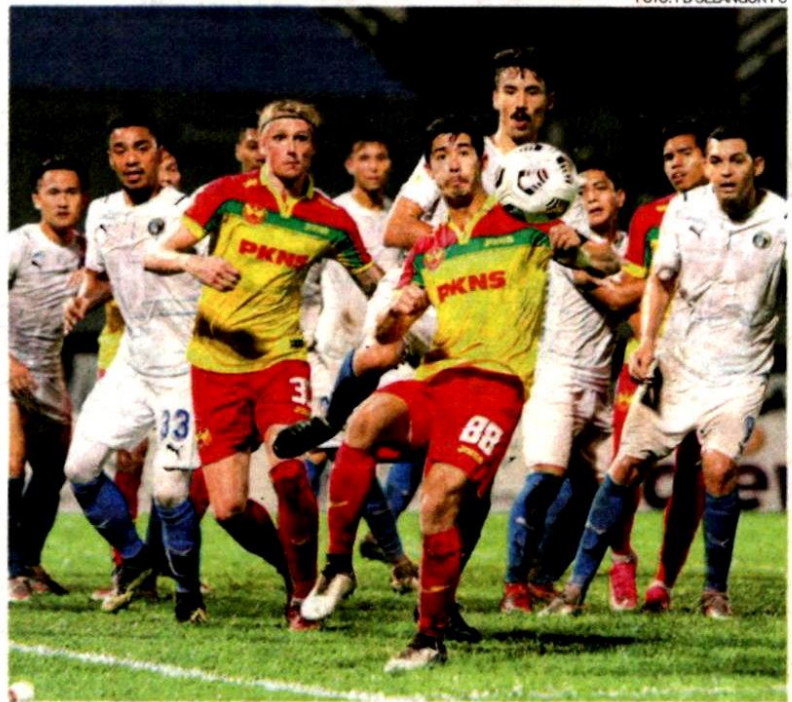
Kedua kelam kabut di depan pintu gol Penang FC dalam aksi di Stadium MBPJ, Kelana Jaya pada Sabtu.

“Mereka hanya ada satu atau dua saat untuk teruskan permainan tetapi kami sentiasa meng-