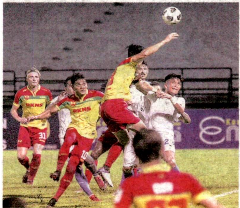
SELANGOR FC berdepan masalah ketumpulan jentera serangan menyebabkan mereka tewas 0-2 kepada Penang FC kelmarin.

"Mengenai isu kepenatan, saya rasa tidak wajar dijadikan seba-