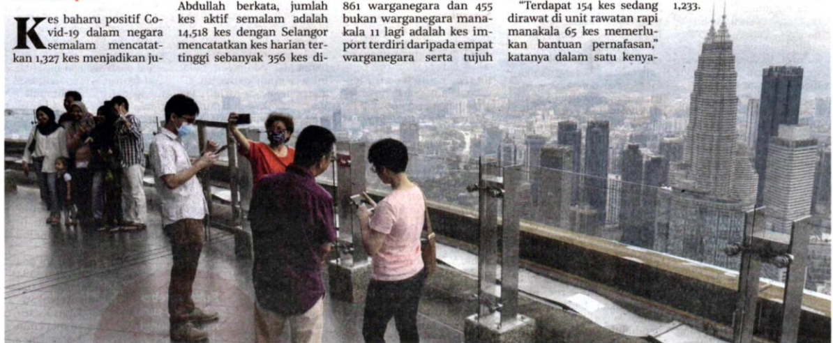
ORANG awam menikmati pemandangan Kuala Lumpur selepas sektor pelancongan dibenarkan kembali beroperasi ketika tinjauan di Menara Kuala Lumpur, semalam.

Dr Noor Hisham berkata, empat kematian direkodkan semalam menjadikan jumlah kematian setakat ini 1,233.