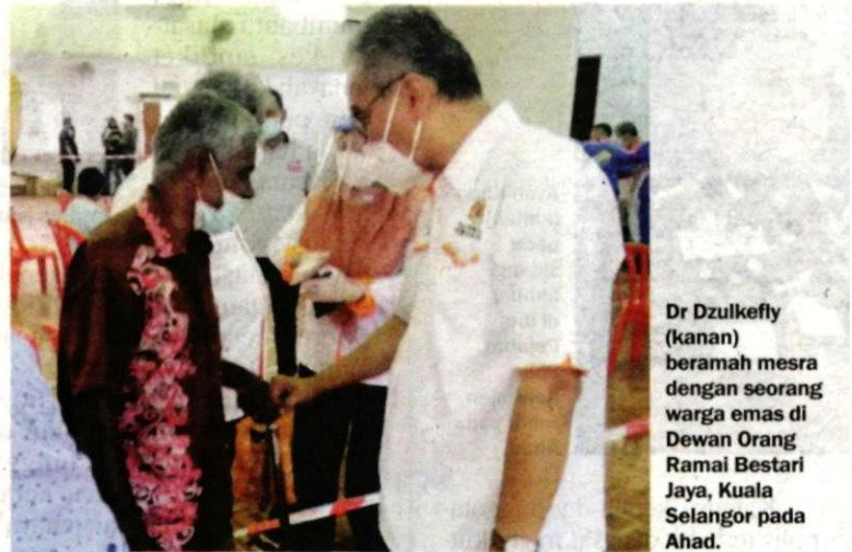
Dr Dzulkefly (kanan) beramah mesra dengan seorang warga emas di Dewan Orang Ramai Bestari Jaya, Kuala Selangor pada Ahad.

pada sidang akhbar ketika menghadiri program ujian saringan Covid-19 percuma di Dewan Orang Ramai Bestari Jaya di sini pada Ahad.