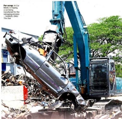
For scrap: At Car Medic in Kajang, a car being transferred for the salvaging process.